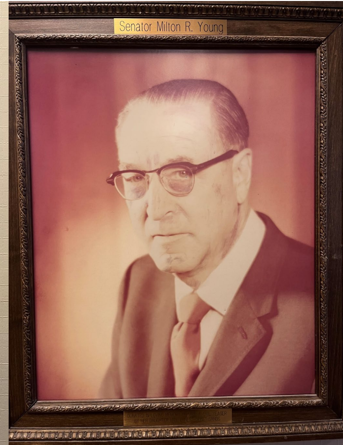
Senator Milton R. Young

GENERAL MATTSON CONST. CO. MECHANICAL MOWBRAY & SON, INC. ELECTRICAL MAIN ELECTRIC, INC.